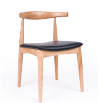
Replica Elbow Chair