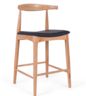
Replica Elbow Bar Stool

W - 54.5cm | D - 47cm | OH - 95.5cm or 105cm