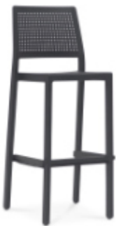
Emi Bar Stool