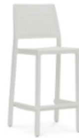
Emi Bar Stool

W - 47.5cm | D - 48.5cm | OH - 99cm SH - 65cm